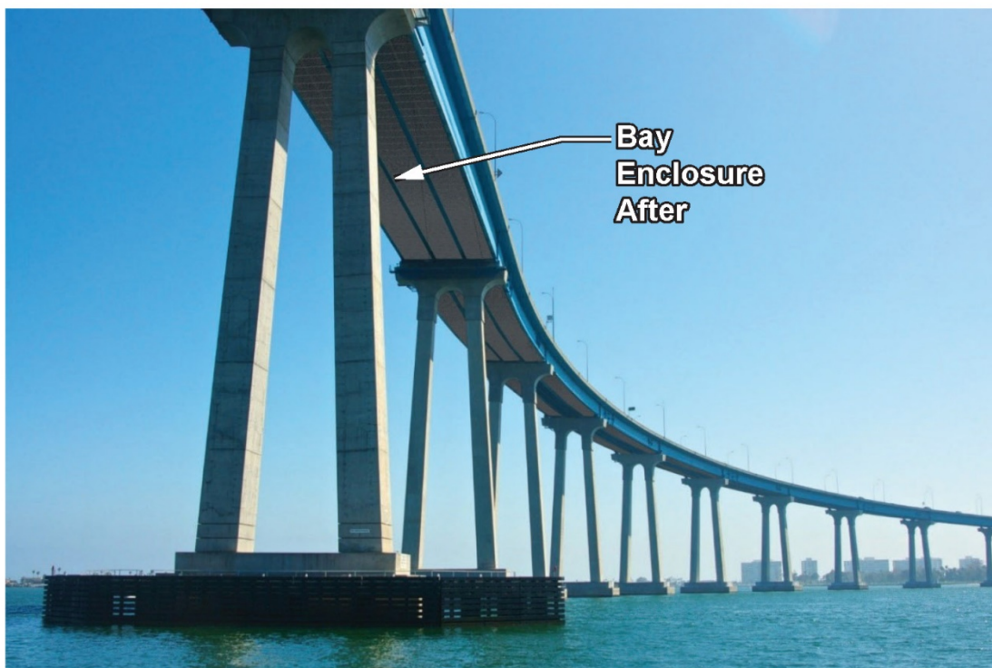
View of the Bridge Bay Enclosures looking South.