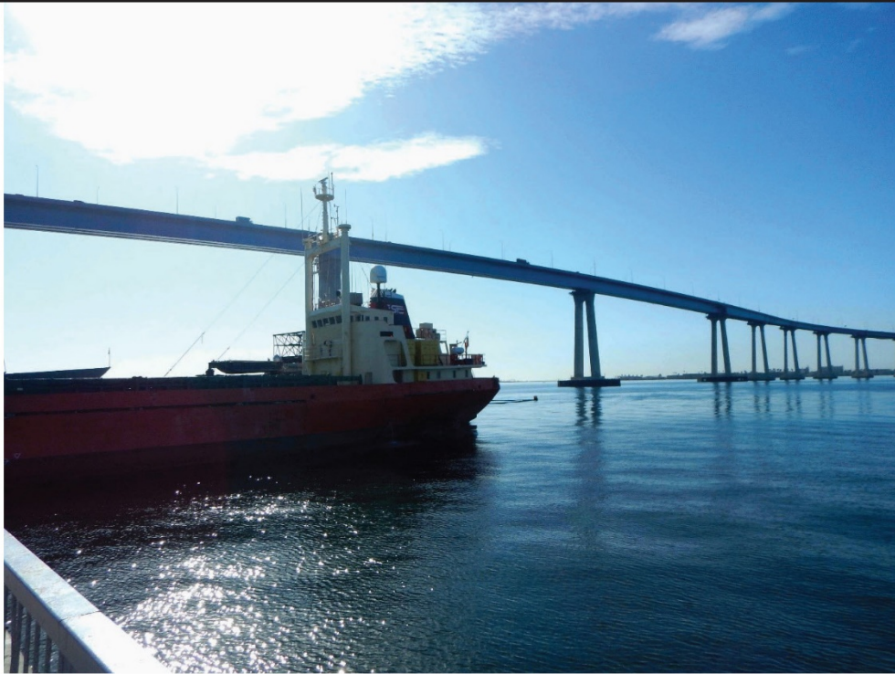
View from Cesar Chavez Pier looking Southwest Before Vertical Net