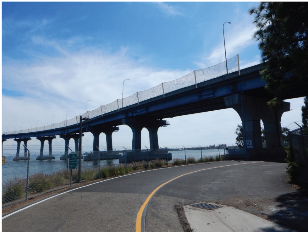
View from Bayshore Bikeway looking south After Vertical Net