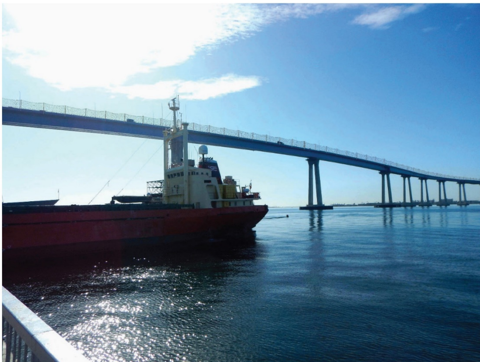
View from Cesar Chavez Pier looking Southwest After Vertical Net