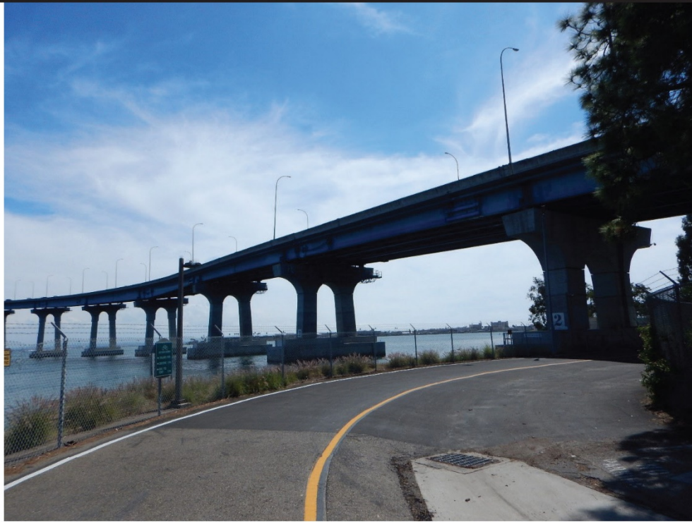
View from Bayshore Bikeway looking South Before Vertical Net