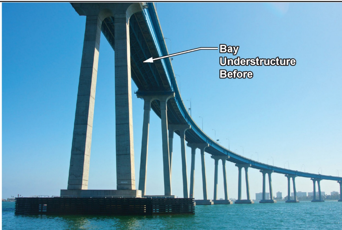
View of the Bridge Bay Understructure looking South.